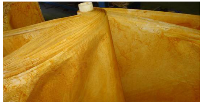
Removes Iron Deposits