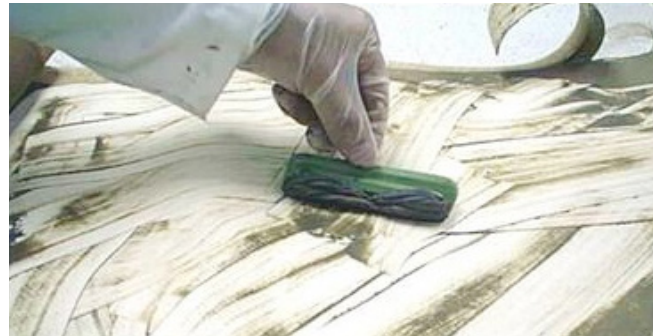
Removes Organic Fouling

The shelf life is two years under normal storage conditions. Ensure the packaging remains well sealed and the Genesol 703 remains dry.