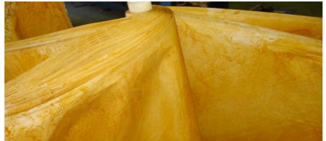
Prevents Iron Fouling