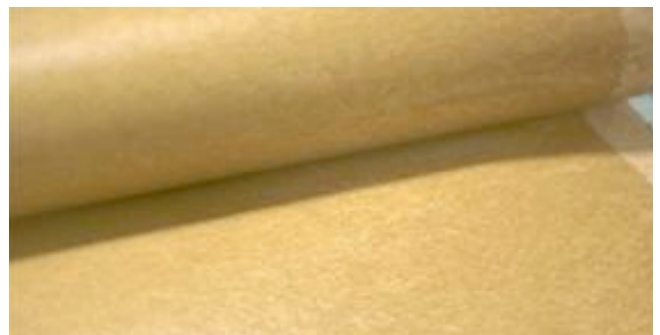
Inhibits silica & inorganic scales